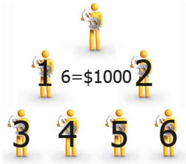
The Level 4 Cyclers Generates $1000

Each position is filled when generating $600 in Prosperity Formula sales volume. When all 6 positions are filled a cycle generates $1,000 in retail sales commission. This can happen as often as you like. (You can cycle multiple times daily-no limit.)