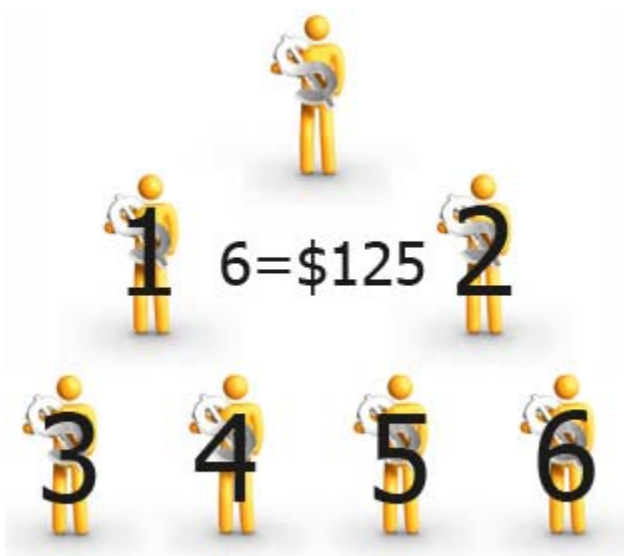
The Level 1 Cycler Generates $125

Each position is filled when generating $75 in Prosperity Formula sales volume. When all 6 positions are filled a cycle generates $125 in retail sales commission. This can happen as often as you like. (You can cycle multiple times daily-no limit.)