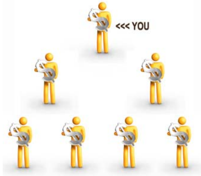
Each 2x2 Cyclers has 6 positions

The Prosperity Formula Compensation Plan is governed by a 2x2 forced matrix. Retail sales commissions are generated each time the 6 available 2x2 matrix positions are filled by selling product either by you or your team. Once these 6 matrix positions are filled, the 2x2 matrix is retired and we automatically assign you a new matrix with 6 open positions. Accordingly, we often call our 2x2 matrix a “recycling matrix” or a “cyclers” for short.