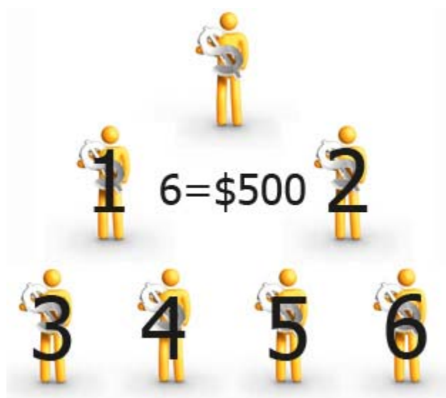
The Level 3 Cycler Generates $500

Each position is filled when generating $300 in Prosperity Formula sales volume. When all 6 positions are filled a cycle generates $500 in retail sales commission. This can happen as often as you like. (You can cycle multiple times daily-no limit.)