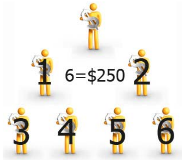
The Level 2 Cycler Generates $250

*Note: Prosperity Formula Products are currently priced to generate sales volume in multiple cyclers levels simultaneously. For example, our Silver Marketing Package is currently priced at $225. The sale of a Silver package will fill a position in your Level 1 and Level 2 Cyclers simultaneously, if you are qualified to operate at both levels.